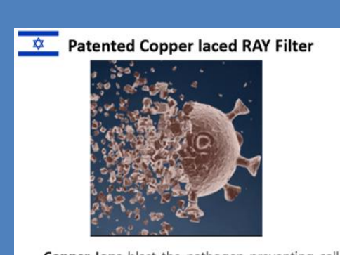
Copper lons blast the pathogen preventing cell respiration and punch holes in the cell membrane/viral coating. They seek and destroy the DNA and RNA inside a bacteria or virus, preventing the mutations that create drugresistant superbugs