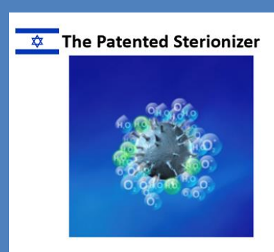
The patented Sterionizer sends positive and negative ions into the air. Oxidants break down the protein structure of viruses and bacteria, rendering them harmless.

Lab Tests were carried out and it is proven that Aura Air can detect, capture and eradicate viruses, bacteria, mold, VOCs. Even dust particles as small as 0.3 micons are not spared.