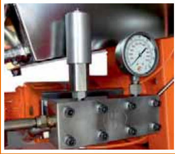
Stainless steel pump-head. Integrated cooling for plunger-seals.