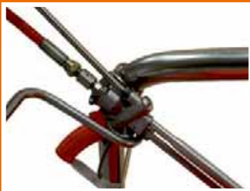
Stainless steel top-frame with gun rest / lance holder.