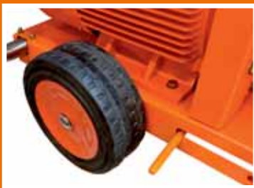
Galvanized frame with built in brake and solid wheels.