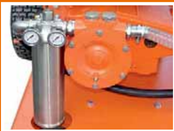
Integrated booster pump & filter system.