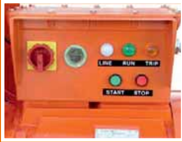
Die cast electrical box with main switch, overload relay & hour meter.