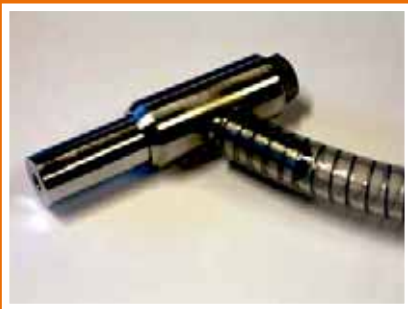
Sand Blasting Equipment