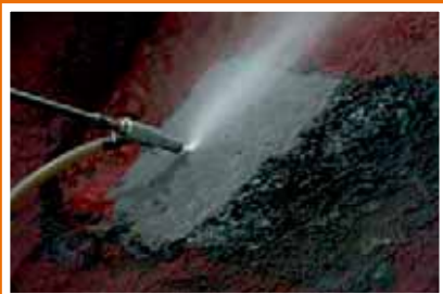
Surface - Sand Blasting