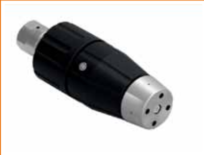
Ultra Impact Rotating Nozzle