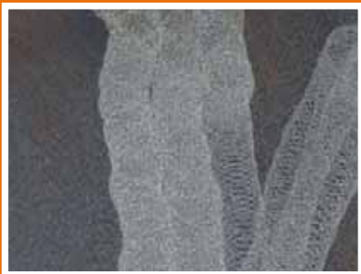
Surface - Ultra Impact Nozzle